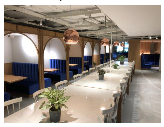
Nippon Life X will continue flexibly engaging in proof of concepts of solutions and services using advanced technologies in its main theme areas of healthcare, childcare and education, work styles, diversity and asset formation to realize improved convenience and service for customers by striving to develop new businesses and services.